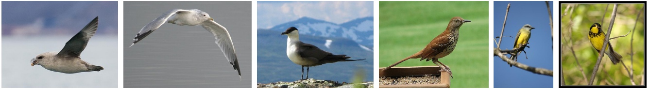
Figure 1: Example images from the CUB-200-2010 dataset.